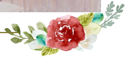
TABLE OF 10 - $1,500 PRIORITY SEATING